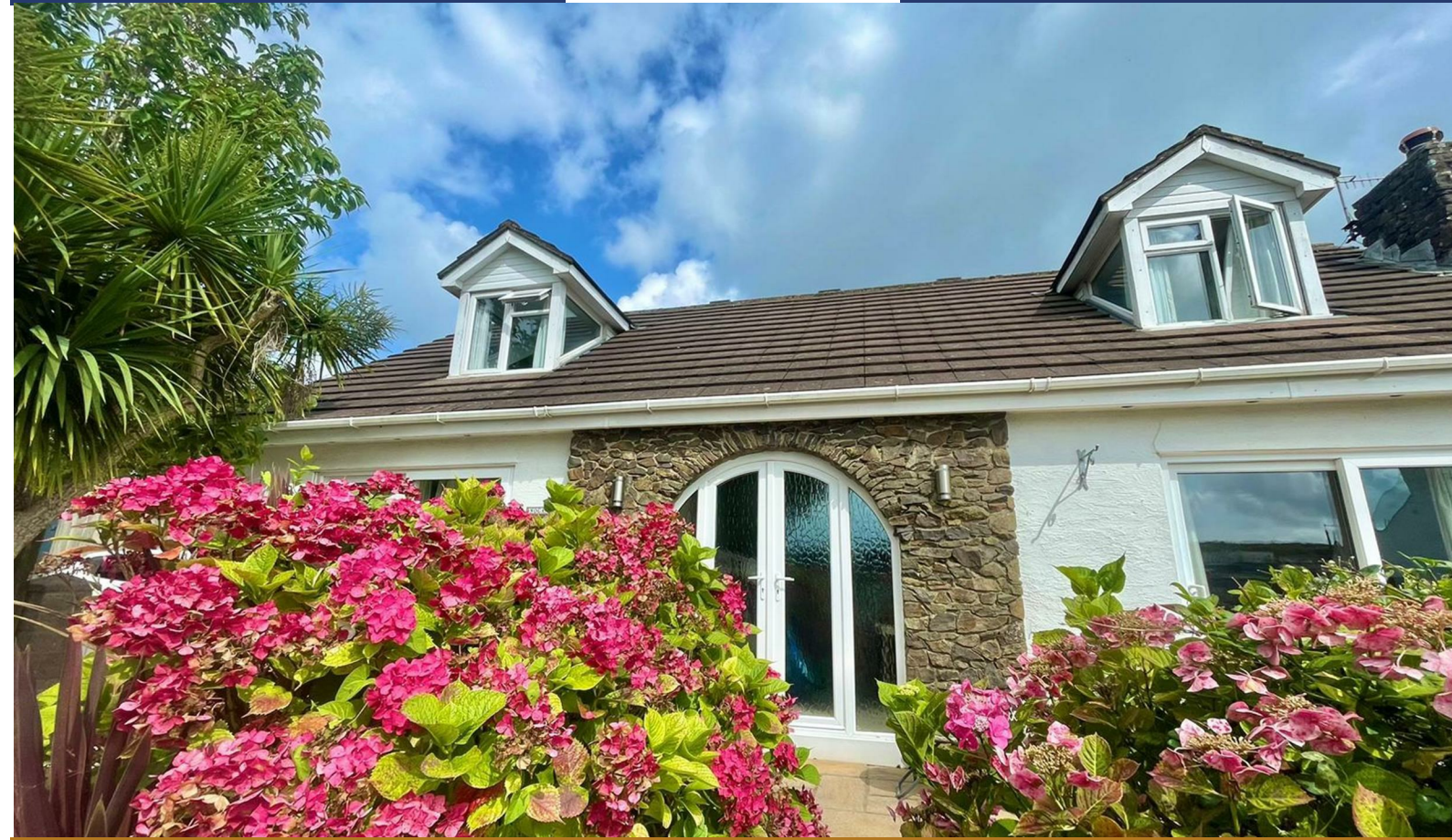
"Wogan Lodge" Wogan Lane, Off Wogan Terrace, Saundersfoot, Pembrokeshire, SA69 9HA